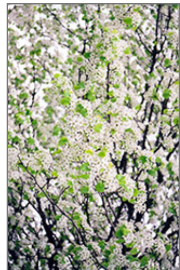
Bradford Ornamental Pear flowers