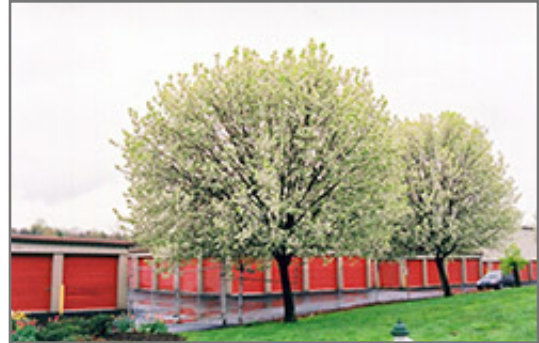
Bradford Ornamental Pear in bloom