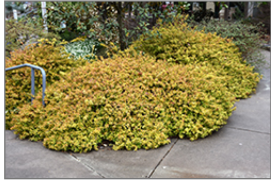
Kaleidoscope Abelia

Kaleidoscope Abelia will grow to be about 30 inches tall at maturity, with a spread of 4 feet. It tends to fill out right to the ground and therefore doesn't necessarily require facer plants in front. It grows at a slow rate, and under ideal conditions can be expected to live for approximately 30 years.