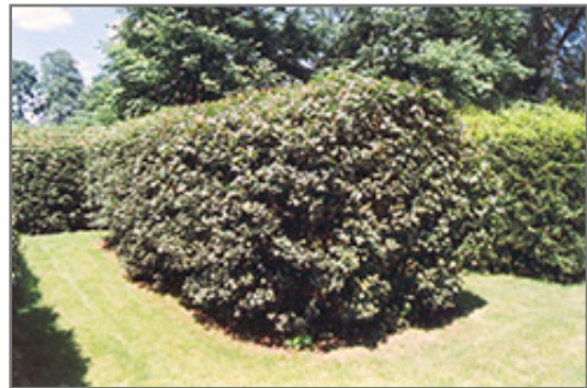
Hedge Maple