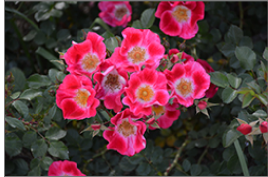
Carefree Spirit Rose flowers

Carefree Spirit Rose is recommended for the following landscape applications;