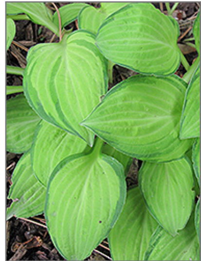
Emerald Tiara Hosta foliage

Emerald Tiara Hosta is recommended for the following landscape applications;