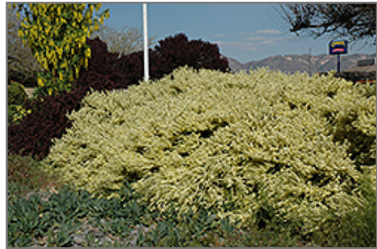
Moonlight Scotch Broom in bloom