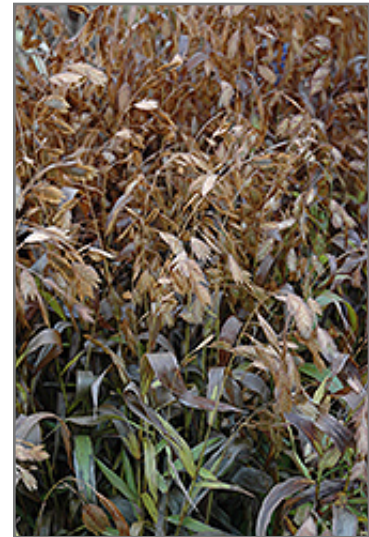
Northern Sea Oats in fall

Northern Sea Oats is recommended for the following landscape applications;