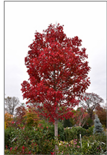
October Glory Red Maple in fall