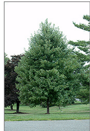
October Glory Red Maple