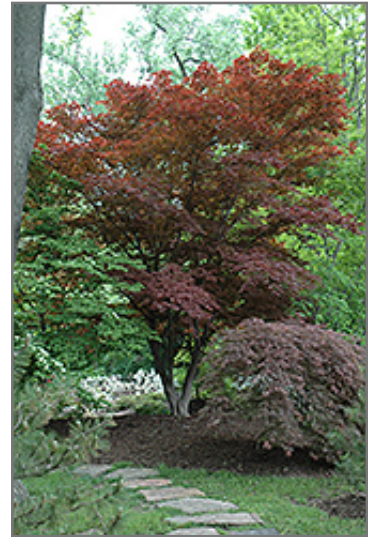
Oshio Beni Japanese Maple