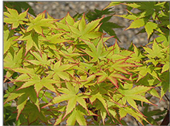
Coral Bark Japanese Maple foliage

Coral Bark Japanese Maple is recommended for the following landscape applications;