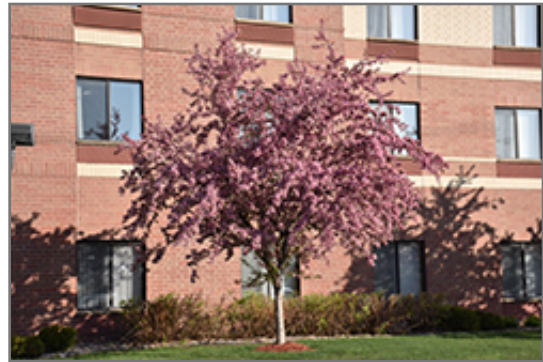
Robinson Flowering Crab in bloom

Robinson Flowering Crab is recommended for the following landscape applications;