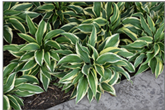
Wolverine Hosta