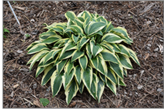
Wolverine Hosta

Wolverine Hosta will grow to be about 12 inches tall at maturity extending to 18 inches tall with the flowers, with a spread of 3 feet. When grown in masses or used as a bedding plant, individual plants should be spaced approximately 30 inches apart. Its foliage tends to remain dense right to the ground, not requiring facer plants in front. It grows at a medium rate, and under ideal conditions can be expected to live for approximately 10 years. As an herbaceous perennial, this plant will usually die back to the crown each winter, and will regrow from the base each spring. Be careful not to disturb the crown in late winter when it may not be readily seen!