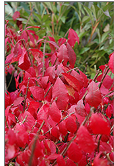
Burning Bush (tree form) in fall