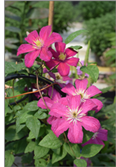
Barbara Harrington Clematis flowers