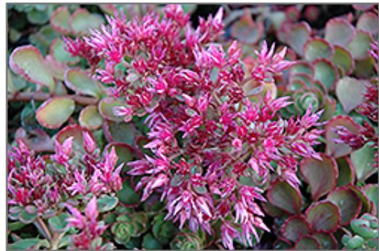
Fulda Glow Stonecrop flowers