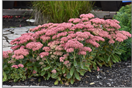
Autumn Fire Stonecrop in bloom

Autumn Fire Stonecrop is recommended for the following landscape applications;