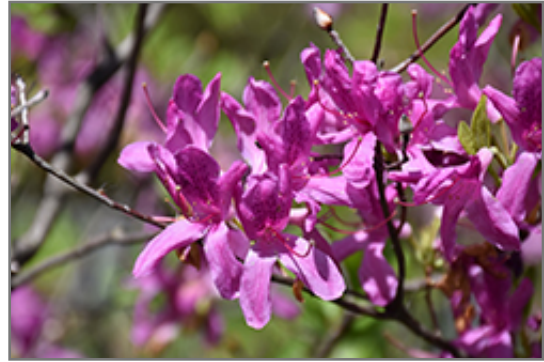
Lilac Lights Azalea flowers