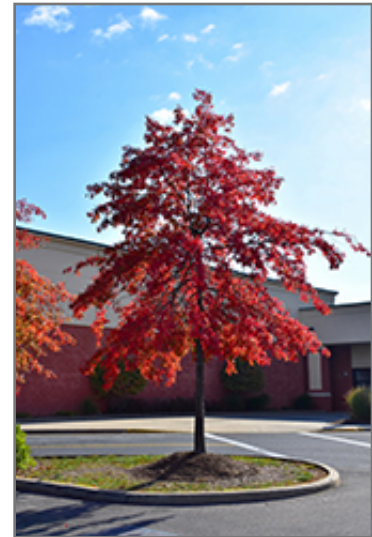
Pin Oak in fall