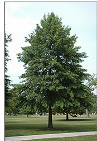
Pin Oak