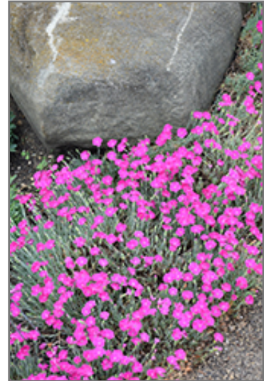
Firewitch Pinks in bloom

Firewitch Pinks is a fine choice for the garden, but it is also a good selection for planting in outdoor pots and containers. It is often used as a 'filler' in the 'spiller-thriller-filler' container combination, providing a mass of flowers and foliage against which the thriller plants stand out. Note that when growing plants in outdoor containers and baskets, they may require more frequent waterings than they would in the yard or garden.