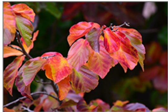
Persian Parrotia in fall