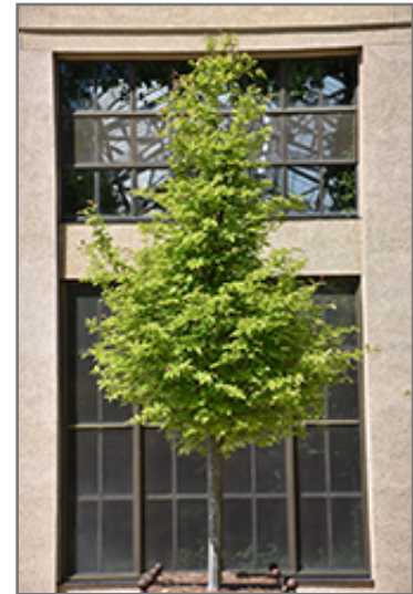
Persian Parrotia