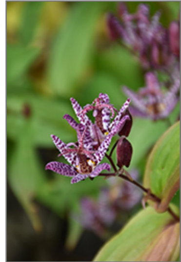
Toad Lily flowers