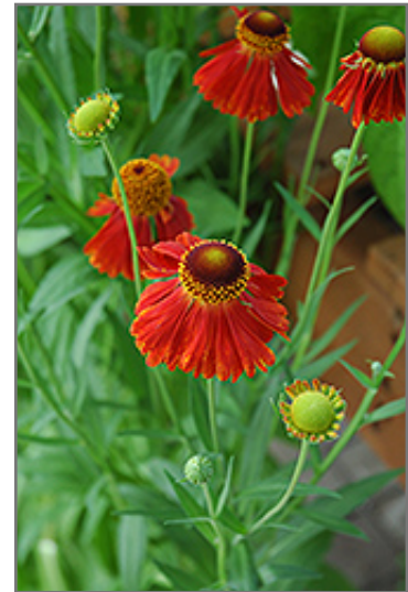
Moerheim Beauty Sneezeweed flowers