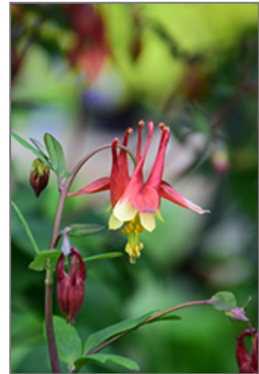
Wild Red Columbine flowers

Wild Red Columbine is recommended for the following landscape applications;