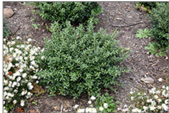
Soft Touch Japanese Holly