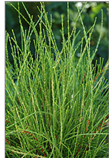
Franky Boy Arborvitae foliage