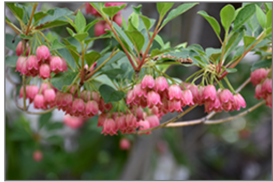
Redvein Enkianthus flowers