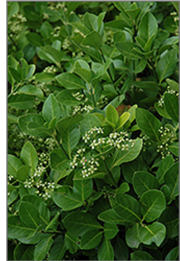
Manhattan Spreading Euonymus flowers

This shrub performs well in both full sun and full shade. It is very adaptable to both dry and moist locations, and should do just fine under average home landscape conditions. It is not particular as to soil type or pH. It is highly tolerant of urban pollution and will even thrive in inner city environments, and will benefit from being planted in a relatively sheltered location. This is a selected variety of a species not originally from North America.