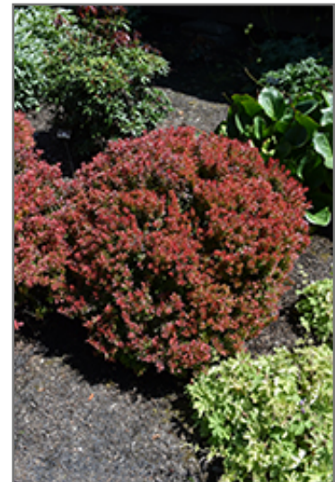
Golden Ruby Barberry