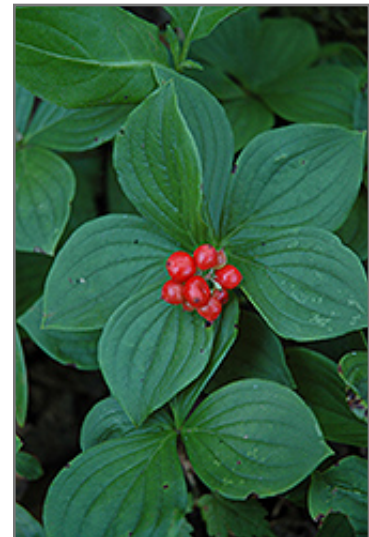
Bunchberry fruit