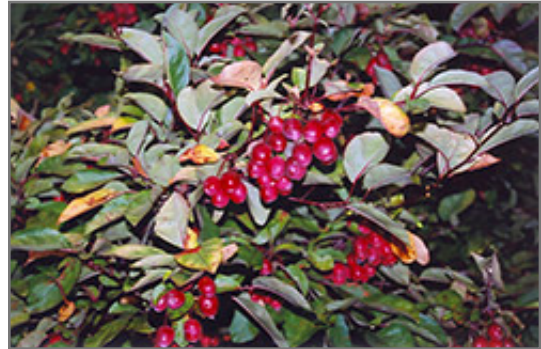
Adams Flowering Crab fruit

* This is a 'special order' plant - contact store for details