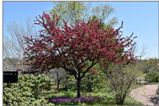
Adams Flowering Crab in bloom

Adams Flowering Crab is recommended for the following landscape applications;