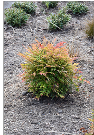
Gulf Stream Dwarf Nandina