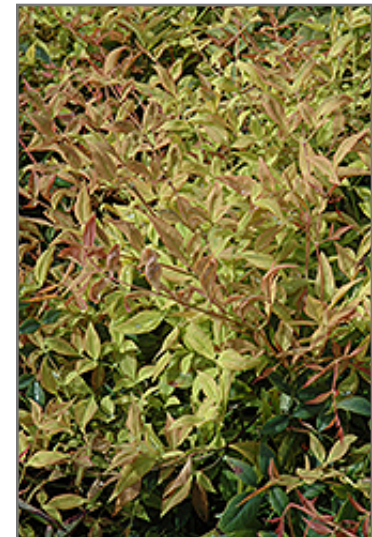
Gulf Stream Dwarf Nandina foliage