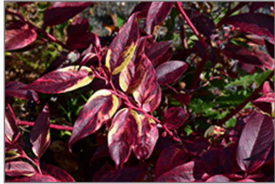
Rainbow Fetterbush in fall

Rainbow Fetterbush makes a fine choice for the outdoor landscape, but it is also well-suited for use in outdoor pots and containers. Because of its height, it is often used as a 'thriller' in the 'spiller-thriller-filler' container combination; plant it near the center of the pot, surrounded by smaller plants and those that spill over the edges. It is even sizeable enough that it can be grown alone in a suitable container. Note that when grown in a container, it may not perform exactly as indicated on the tag - this is to be expected. Also note that when growing plants in outdoor containers and baskets, they may require more frequent waterings than they would in the yard or garden.