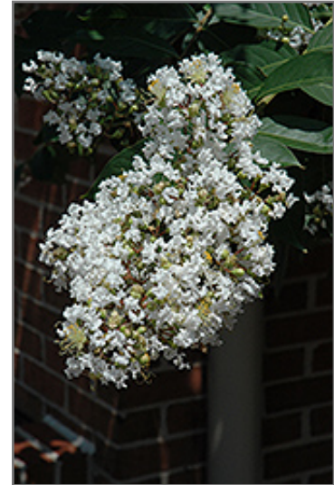
Natchez Crapemyrtle flowers

This is a relatively low maintenance tree, and is best pruned in late winter once the threat of extreme cold has passed. Deer don't particularly care for this plant and will usually leave it alone in favor of tastier treats. It has no significant negative characteristics.