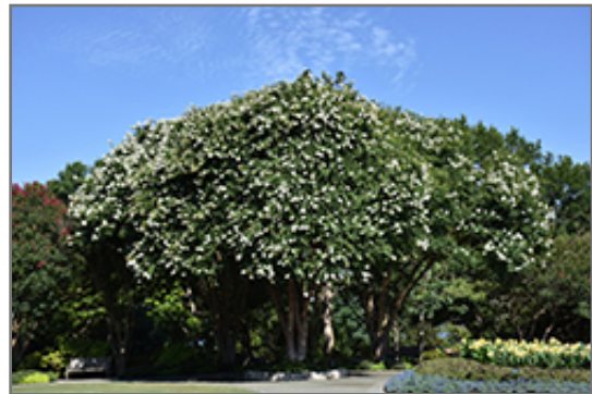
Natchez Crapemyrtle in bloom