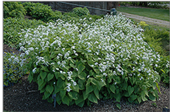
Perennial Money Plant in bloom

Perennial Money Plant is recommended for the following landscape applications;