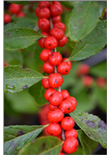
Red Sprite Winterberry fruit

Red Sprite Winterberry is recommended for the following landscape applications;