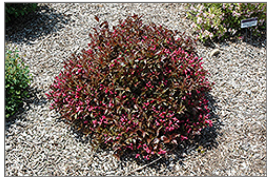
Shining Sensation Weigela in bloom