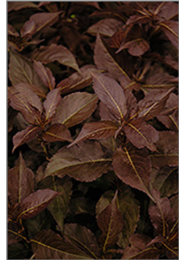
Shining Sensation Weigela foliage

* This is a 'special order' plant - contact store for details