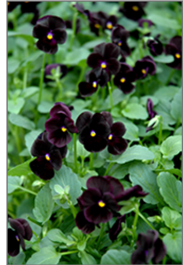
Sorbet Black Delight Pansy flowers