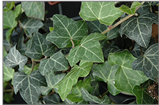
Baltic Ivy foliage