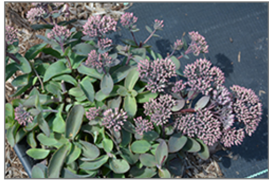
Chocolate Drop Stonecrop flower buds