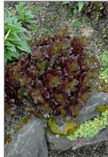
Chocolate Drop Stonecrop

Chocolate Drop Stonecrop is a dense herbaceous perennial with an upright spreading habit of growth. Its relatively coarse texture can be used to stand it apart from other garden plants with finer foliage.