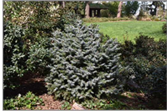
Papoose Dwarf Sitka Spruce