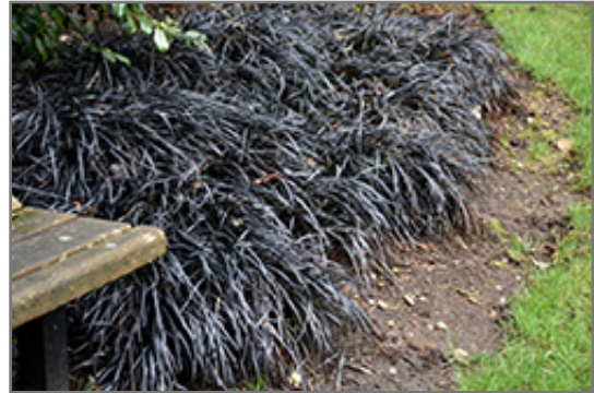
Black Mondo Grass

Black Mondo Grass is recommended for the following landscape applications;