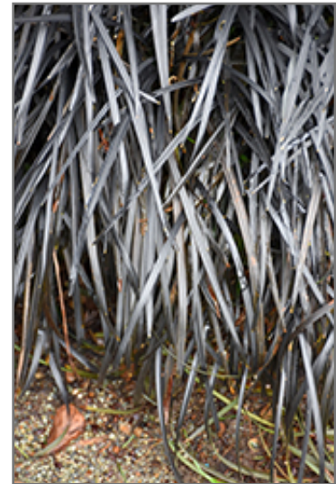
Black Mondo Grass foliage

Black Mondo Grass is a fine choice for the garden, but it is also a good selection for planting in outdoor pots and containers. It is often used as a 'filler' in the 'spiller-thriller-filler' container combination, providing a mass of flowers and foliage against which the thriller plants stand out. Note that when growing plants in outdoor containers and baskets, they may require more frequent waterings than they would in the yard or garden.