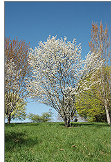
Princess Diana Serviceberry in bloom