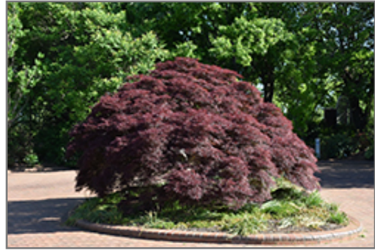
Purple-Leaf Threadleaf Japanese Maple

Purple-Leaf Threadleaf Japanese Maple is recommended for the following landscape applications;