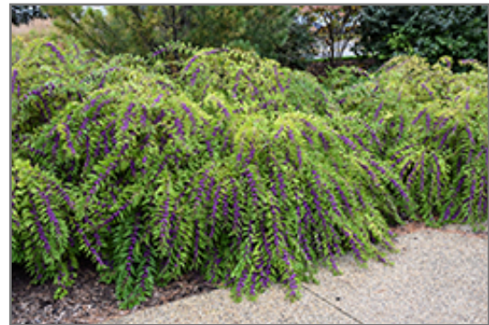
Issai Beautyberry fruit