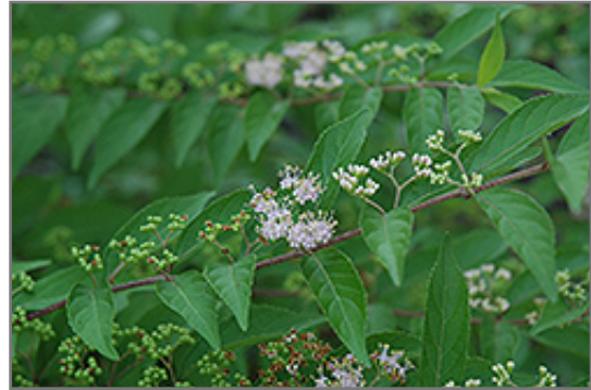
Issai Beautyberry flowers

Issai Beautyberry will grow to be about 4 feet tall at maturity, with a spread of 5 feet. It tends to fill out right to the ground and therefore doesn't necessarily require facer plants in front. It grows at a fast rate, and under ideal conditions can be expected to live for approximately 20 years.