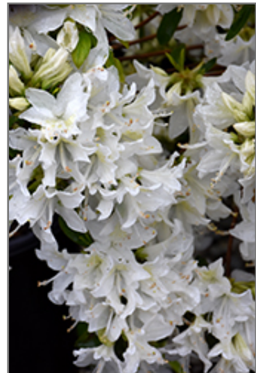
Cascade Azalea flowers