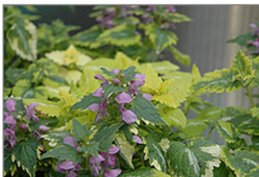
Anne Greenaway Spotted Dead Nettle flowers