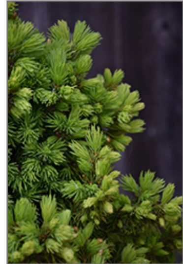
Rainbow's End Spruce foliage

This shrub should only be grown in full sunlight. It prefers to grow in average to moist conditions, and shouldn't be allowed to dry out. It is not particular as to soil type or pH. It is somewhat tolerant of urban pollution, and will benefit from being planted in a relatively sheltered location. This is a selection of a native North American species.