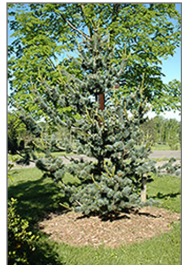
Short-Needled Japanese Blue Pine