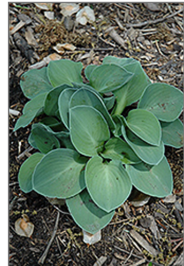
Blue Mouse Ears Hosta