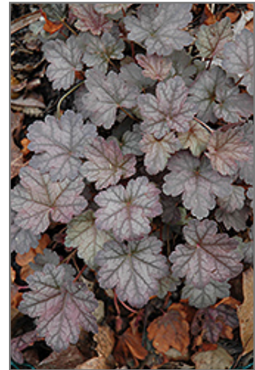
Dolce Mocha Mint Coral Bells foliage

Dolce Mocha Mint Coral Bells is recommended for the following landscape applications;